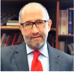
JOSÉ RAMÓN COSSÍO FORMER MEXICAN SUPREME COURT JUSTICE

José Ramón Cossío Díaz is a Mexican lawyer who served as Minister of the Supreme Court of Justice of Mexico from December 2003 to November 2018. He has been a professor at various institutions such as the National Preparatory School of UNAM, the Instituto Tecnológico de Estudios Superiores de Monterrey -Unidad Colima-, and the Faculty of Law of the UNAM. Throughout his career, he has received various recognitions such as the Benito Juárez-Peña Colorada Award, the Research Award from the Mexican Academy of Sciences and the National Award for Sciences and Arts in the area of History, Social Sciences and Philosophy. He has written many books and published articles and memoirs in a variety of journals, magazines and newspapers. Since 2014 he has been a member of the National College.