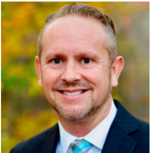
ERIC F. HINTON ROWLING CENTER FOR BUSINESS LAW AND LEADERSHIP

José Ramón Cossío Díaz is a Mexican lawyer who served as Minister of the Supreme Court of Justice of Mexico from December 2003 to November 2018. He has been a professor at various institutions such as the National Preparatory School of UNAM, the Instituto Tecnológico de Estudios Superiores de Monterrey -Unidad Colima-, and the Faculty of Law of the UNAM. Throughout his career, he has received various recognitions such as the Benito Juárez-Peña Colorada Award, the Research Award from the Mexican Academy of Sciences and the National Award for Sciences and Arts in the area of History, Social Sciences and Philosophy. He has written many books and published articles and memoirs in a variety of journals, magazines and newspapers. Since 2014 he has been a member of the National College.